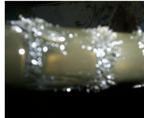
Magnetic filter rods with the ferrous contaminants extracted from the gear case oil